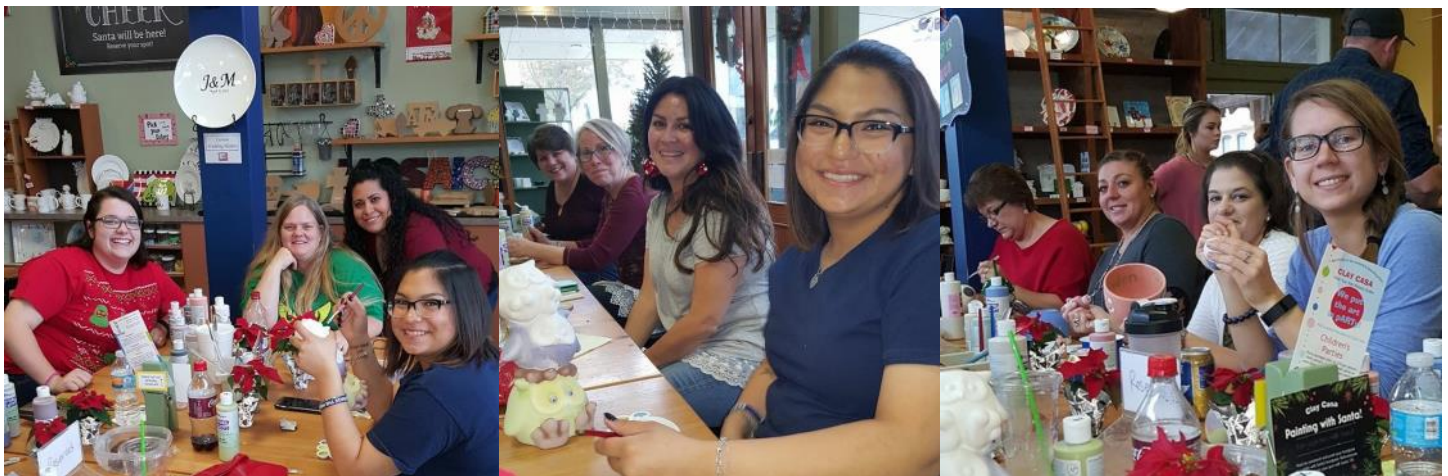
Our wonderful teachers and support staff spent a Sunday afternoon painting pottery at Clay Casa. Some much-needed laughs and fellowship and we have some talented artist among us.

Last month was amazing! We closed out the year with supporting 7 children and 1 elderly through the angel tree program. This was possible with the offering brought each week by the children to Chapel on Wednesday mornings. We provided clothes, shoes, coats, toys, art supplies, towels and more.