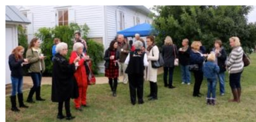
Family Christmas Caroling at St. Martin