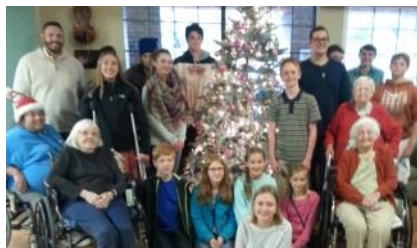
Youth Tree Trimming Party