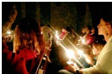
Advent by Candlelight