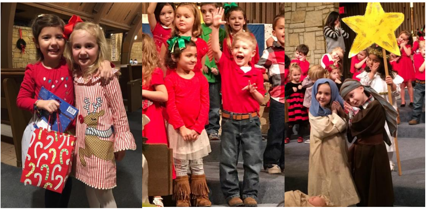
Already a warm and fuzzy time of year but seeing and hearing our preschool children at the altar for the Christmas Program just melts the heart of all. The children did a fantastic job and sang beautiful praises.